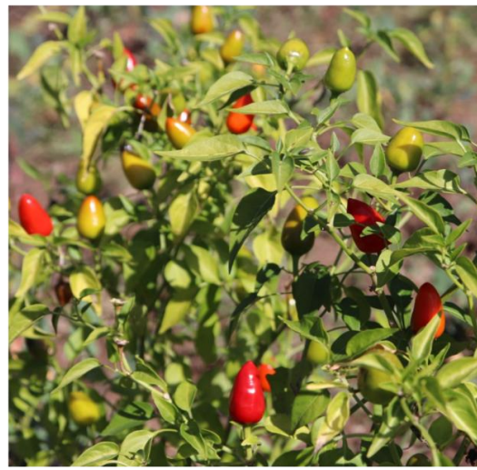
Availability of fresh produce for students and staff at faculty of Agriculture, UPR