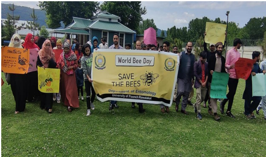
World Bee Day Celebration at University of Poonch Rawalakot attended by students, faculty, and the wider community