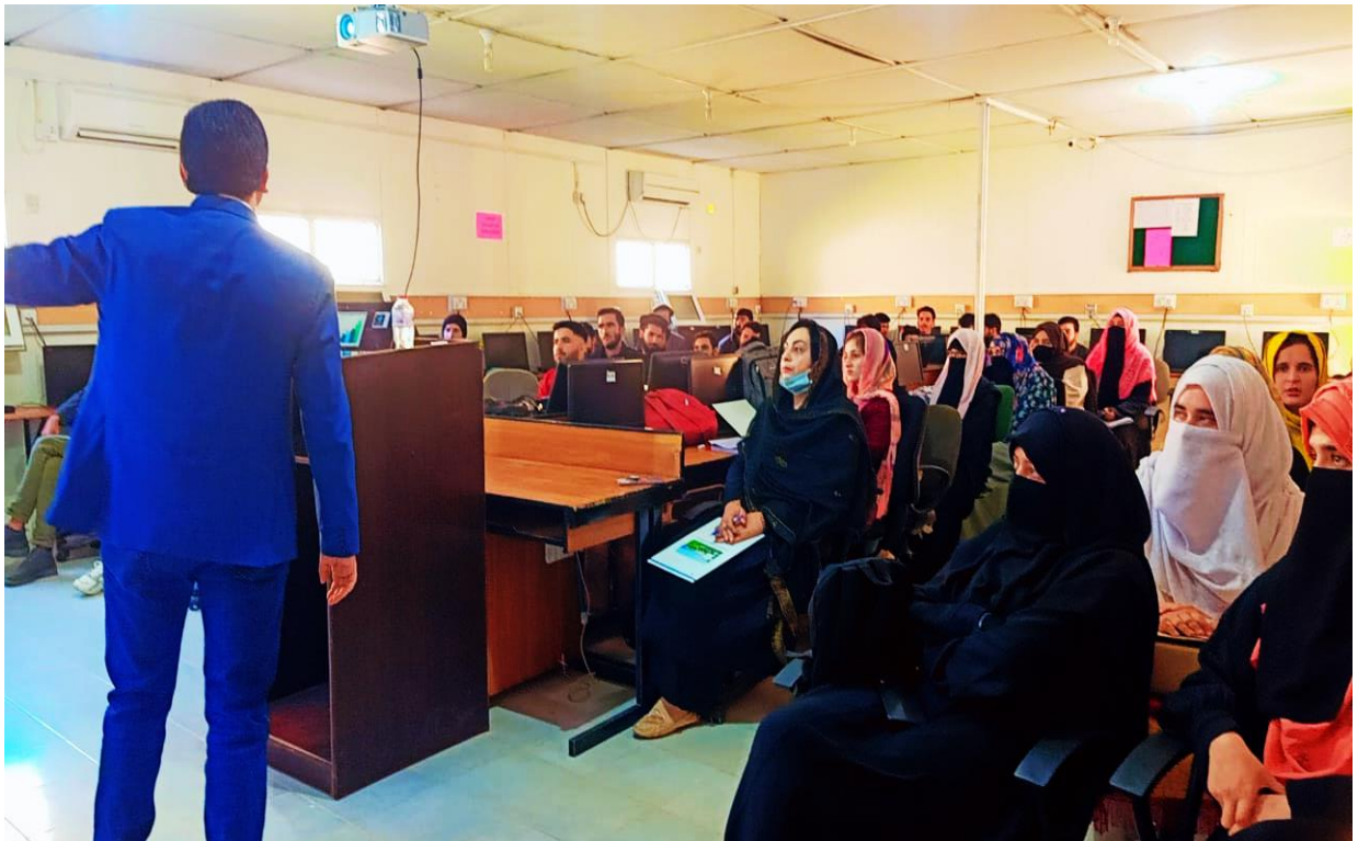
EmpowerHer: Career Bootcamp for Female Graduates

EmpowerHer is a specialized career bootcamp tailored exclusively for female graduates, designed to provide them with the essential tools and guidance needed to embark on a successful professional journey after graduation. The program encompasses a range of valuable components, including personalized career assessments, skill-building workshops on resume crafting and interview acumen, and insightful sessions with industry experts. Participants will also have the opportunity to network with accomplished female professionals, explore entrepreneurship and freelancing, and gain strategies for achieving a healthy work-life balance. Additionally, EmpowerHer offers a mentorship program for ongoing support and access to post-bootcamp resources, job listings, and exclusive events. With a commitment to