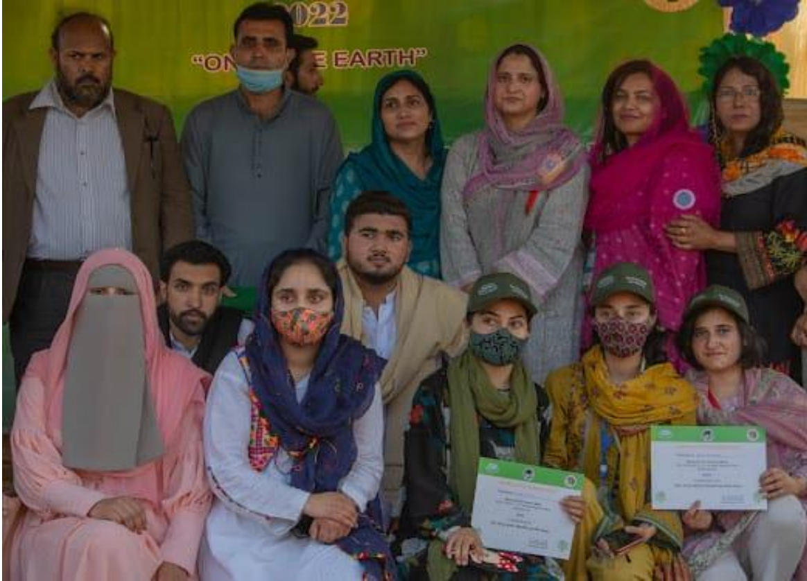
UPR students and faculty join forces with the NGO National Cleaner Production Center in a powerful World Environment Day collaboration