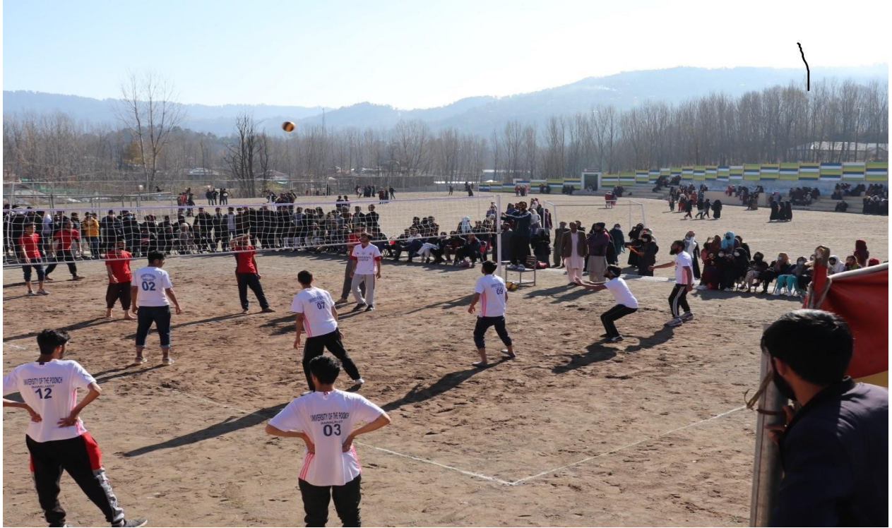
University of Poonch Trar Campus: A Center of Games, Sports, and Community Spirit! From school tournaments to neighborhood gatherings, our playground is a lively area for encouraging excellence, unity, and good health. "