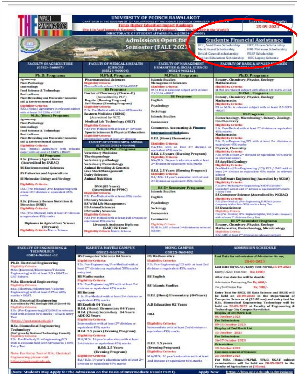
UPR admission advisement showing a list of scholarships for deserving students are marked by a red circle