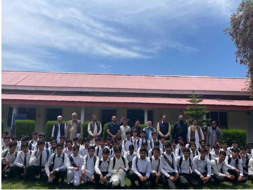
Student counseling seminar aimed at Khan Muhammad Khan Postgraduate College Palandri, AJK