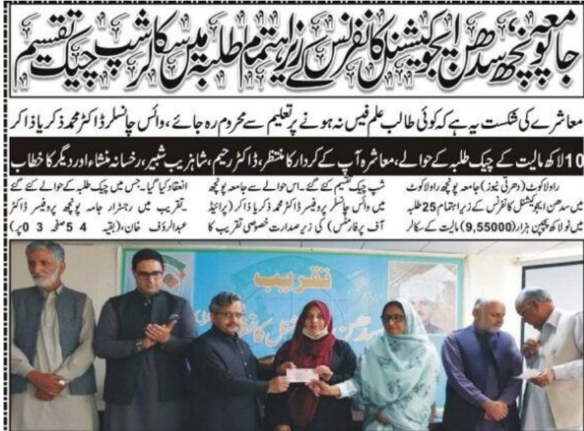
Distribution of Scholarship cheques form Sudhan Education Foundation